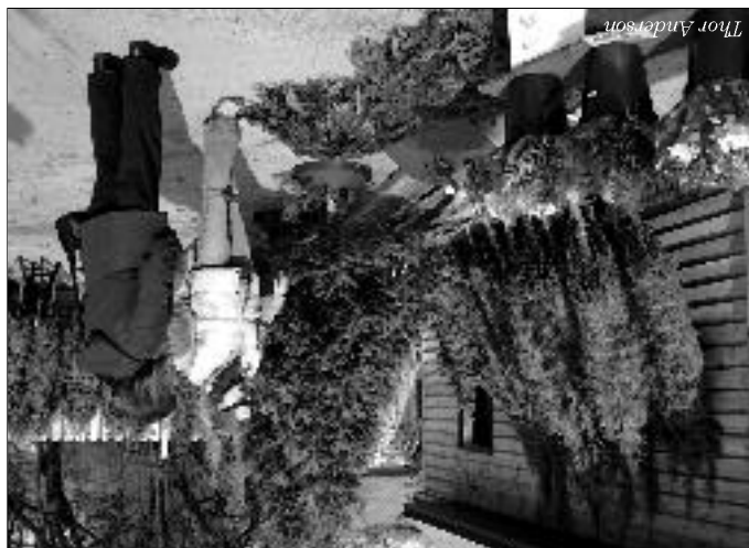
Guess who is back in business after an arsonist destroyed their flower shop? See page 4 for details!

NON PROFIT ORG U.S. POSTAGE PAID MINNEAPOLIS, MN PERMIT NO. 3362