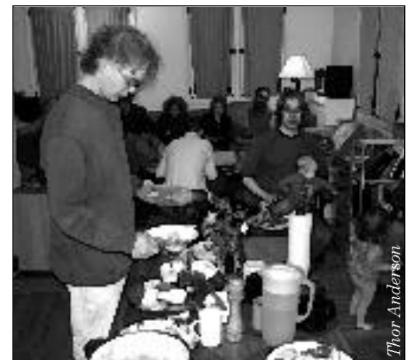
Neighbors enjoy a potluck dinner before the movie.