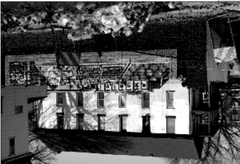
Untimely demise of Fischer Grocery Mural, 34th and Nicollet Ave. September 2007 - February 2008.

NON PROFIT ORG U.S. POSTAGE PAID MINNEAPOLIS, MN PERMIT NO. 3362