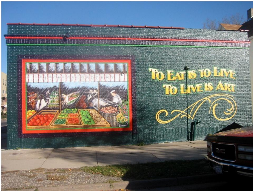
Finished Fischer Grocery Mural 9/07