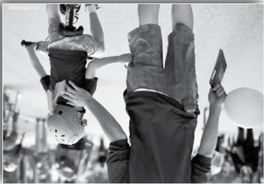
"Creating connections at Nicollet Open Streets, 2015"

Kingfield Neighborhood Association 3754 Pleasant Avenue South Minneapolis, Minnesota 55409 612-823-5980 • info@kingfield.org www.kingfield.org